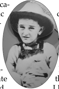
LBJ age 5-6

The tragedy of Vietnam is only a distant cloud in this book. As Johnson continued taping throughout his entire administration, we will have to wait for the subsequent volumes by Beschloss to read how Johnson regarded the disastrous sequence of events after the 1964 election that ultimately led him to retire from politics in 1968. It should be well worth the wait.