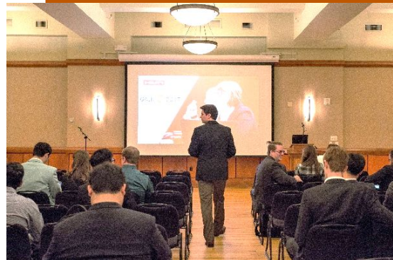
BANQUET & AWARDS CEREMONY