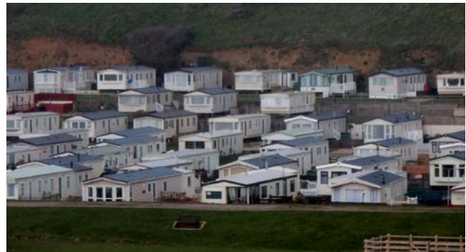
Mobile Homes by oatsy40 on Flickr, licensed under Creative Commons by 2.0.

Around the country, there are many examples of comprehensive mobile home park preservation programs that incorporate a range of tools to promote the preservation of these affordable housing opportunities. In New Hampshire, for example, residents have purchased over 120 mobile home communities, preserving more than 7,200 homes. Public policies to support resident ownership typically include a right to purchase, funding for resident organizing, legal and technical assistance, and legal protections to allow residents to organize and form resident associations. Fortunately, financing is already available for qualified resident acquisitions of mobile home parks through groups like ROC USA, a national nonprofit social venture with a proven track record of financing resident ownership of mobile home communities. ROC USA has already financed at least one mobile home resident ownership project in Texas (Pasadena Trails). A comprehensive preservation program should include active monitoring of mobile home parks most at risk of redevelopment, which could be led by a city preservation officer or nonprofit preservation network.