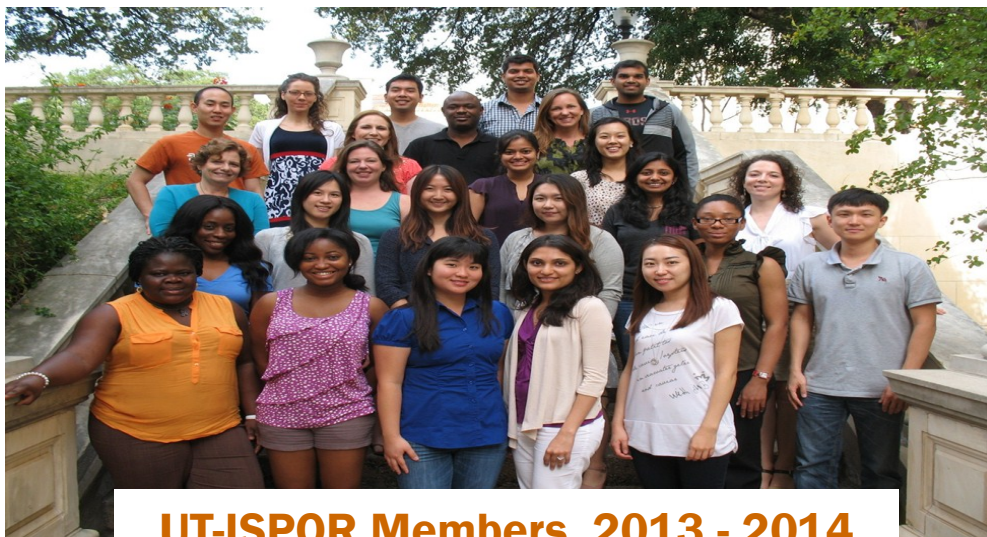
UT-ISPOR Members, 2013 - 2014