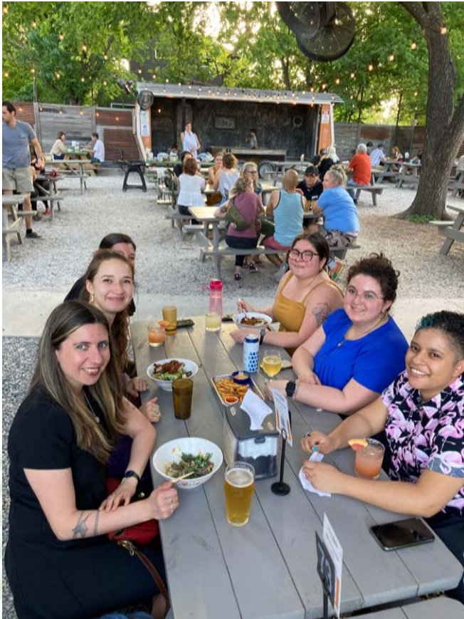
Participating students at closing dinner of ISLAA Forum, April 2022.