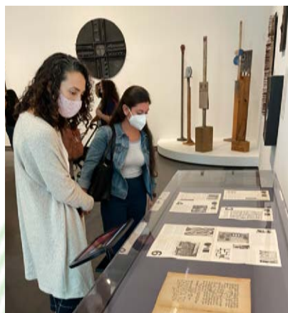
CLAVIS students at the MFAH, November 2021.