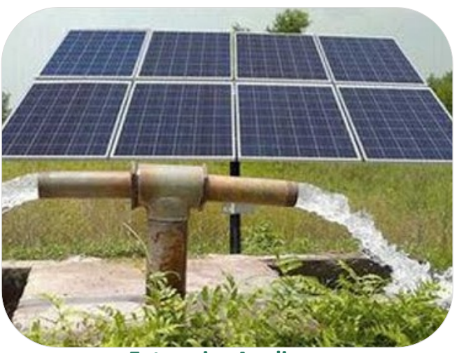
Enterprise Appliances for productive use