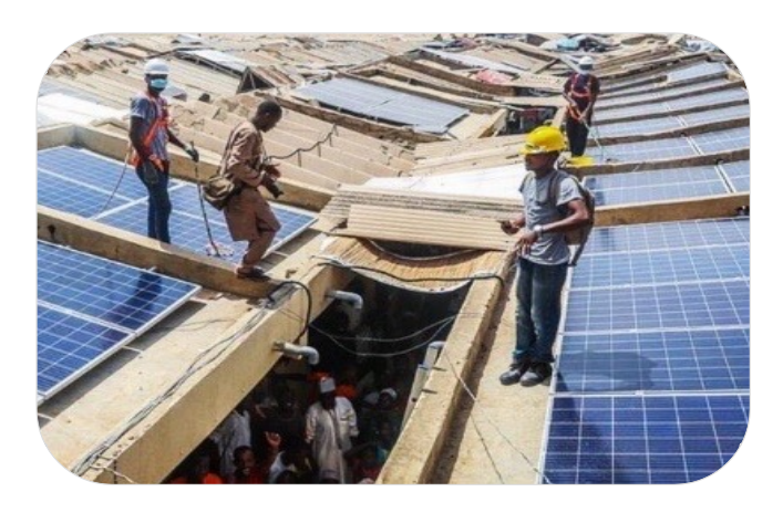
Commercial & Industrial Enterprise clusters and markets