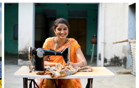
Climate-smart and clean fuels

Distributed, digitally-enabled infrastructure