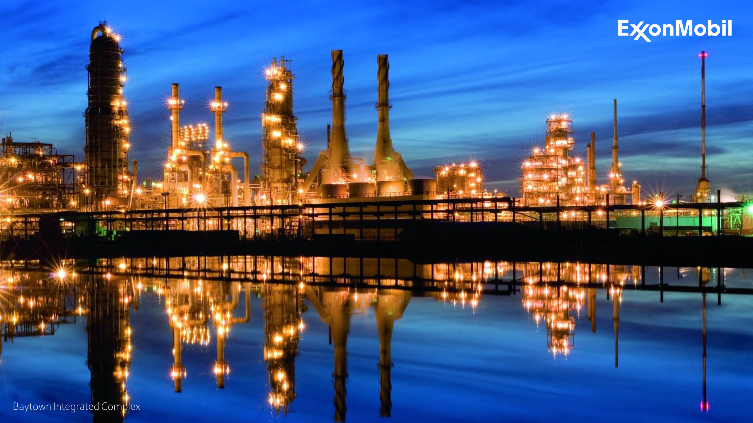
Baytown Integrated Complex