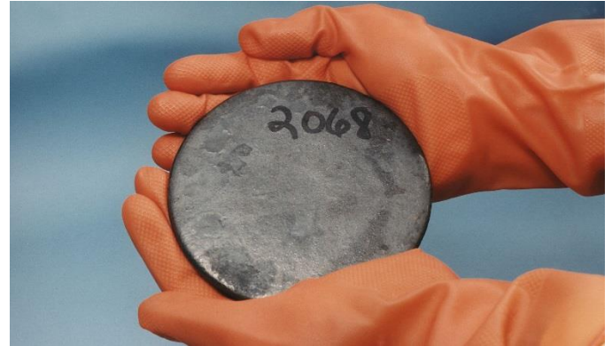
Less than 50 pounds of HEU is enough for an atomic bomb; The Navy uses 5,000 pounds annually for ships.

In March 2016, the White House stated : "Consistent with its national security requirements and in recognition of the nonproliferation benefits to minimizing the use of highly enriched uranium globally, the United States values investigations into the viability of using low-enriched uranium in its naval reactors."