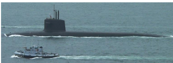
France has switched to LEU fuel for its entire nuclear navy, including this ballistic-missile submarine.

France has converted its naval reactors from HEU to LEU fuel, and China's nuclear navy also uses LEU fuel. The U.S. has converted most of its nuclear research reactors from HEU to LEU fuel, and encourages all other countries to do so, to reduce risks of nuclear proliferation and terrorism.