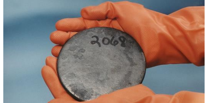
Less than 50 pounds of HEU is enough for an atomic bomb; The Navy uses 5,000 pounds annually for ships.

In March 2016, the White House stated : “Consistent with its national security requirements and in recognition of the nonproliferation benefits to minimizing the use of highly enriched uranium globally, the United States values investigations into the viability of using low-enriched uranium in its naval reactors.”