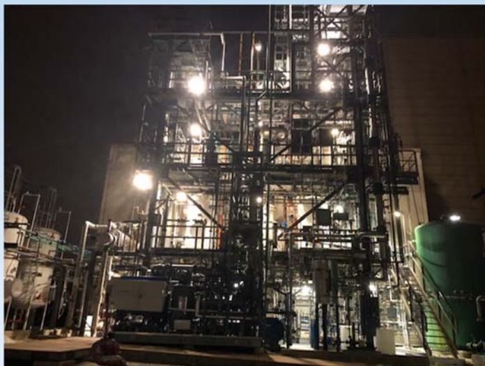
New LED lighting courtesy of the Appleton Group