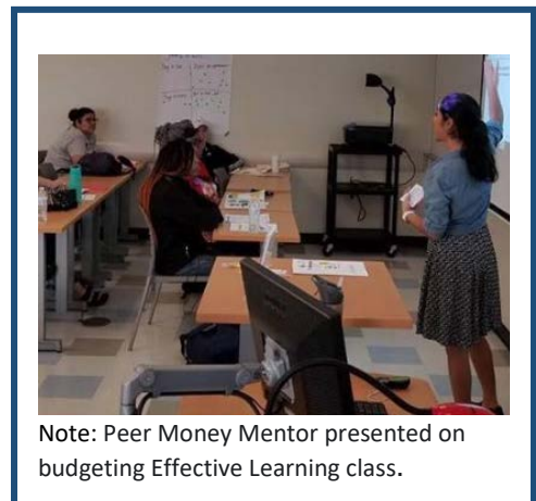
Note: Peer Money Mentor presented on budgeting Effective Learning class.

The PMM program continues to evolve as new avenues for PPMs to assist their student peers are developed. During the 2018-2019 school year, the 15 Peer Money Mentors extended SMMO's reach by sharing what they have learned through their participation in the mentor program with their peers. Their final semester project required the PMMS to conduct a 10-minute workshop on a money management topic of their choice to one of their class. For example, mentors presented to Music Appreciation, Biology, and Accounting classes to share what they learned with 285 students. Topics ranged from credit cards, budgeting, and student resources. These presentations increased outreach of the SMMO mission and services as PMMs increased SMMO's connections to new departments.