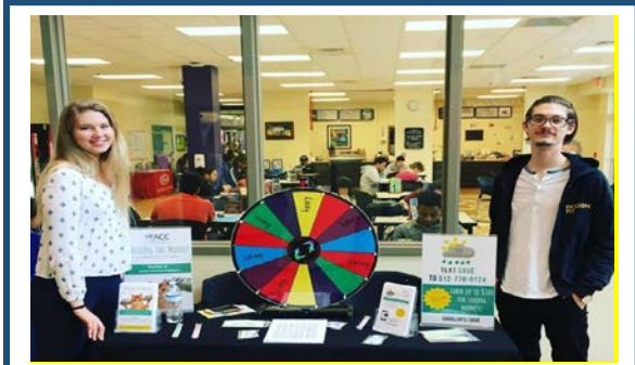
Note: Peer Money Mentors working outreach for our Rainy Day Savings Program and Finding the Money Scholarship Workshop.

The 2018-2019 PMM training included: introduction to SMMO social media channels and content creation, as well as discussions on fundamentals of budgeting, saving, debt, side-hustling, and scholarship searching. The PMMs continue to assist at the Riverbat Bash tabling events and other tabling opportunities providing an avenue to talk with students about personal finance and the SMMO program, and assisted with the Finding the Money workshops.