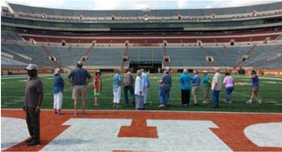
RFSA travel group in Darrell K Royal-Texas Memorial Stadium during tour of athletics facility

Shades of Ireland - August 22 – September 3, 2017 , This trip includes the entire island, featuring Dublin, Kilkenny, Waterford, the Blarney Stone, Killar-