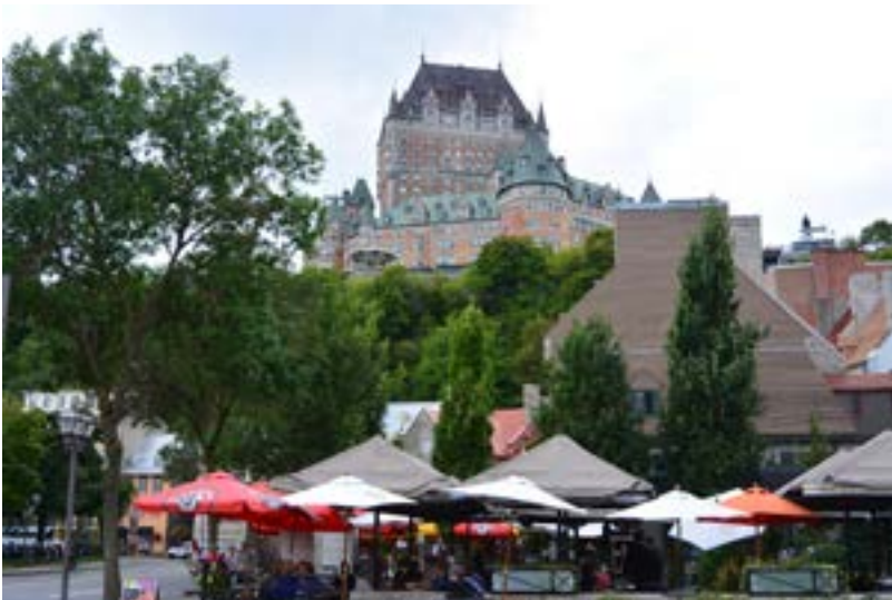
Chateau Frontenac, Old Quebec City

Boarding the bus, we traveled east to Quebec City, located on the bluffs overlooking the St. Lawrence River. The city serves as the political and legislative capital of the province of Quebec. We had a fascinating walking tour of Old Town—the only walled city north of Mexico. The