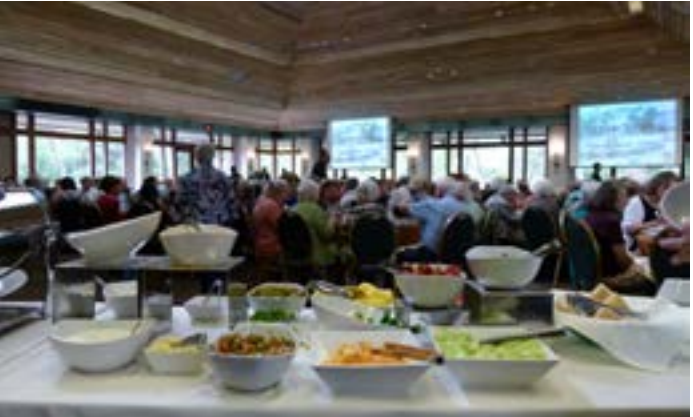
A delicious lunch buffet courtesy of the President’s Office