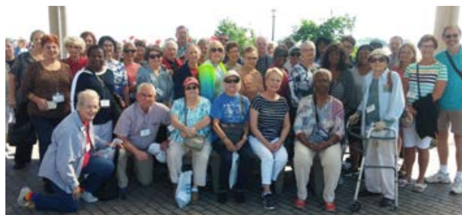
RFSA group outside of the Canadian welcome center at Niagara Falls. Some non-RFSA members who were on the trip with us are in the picture.

Members of RFSA visited the UT Athletic Department and the Darrell K. Royal-Texas Memorial Stadium on Monday, July 25, 2016, and enjoyed a