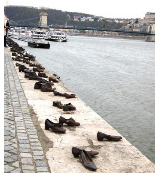
Shoes On The Danube Bank Holocaust Memorial in Budapest, Hungary