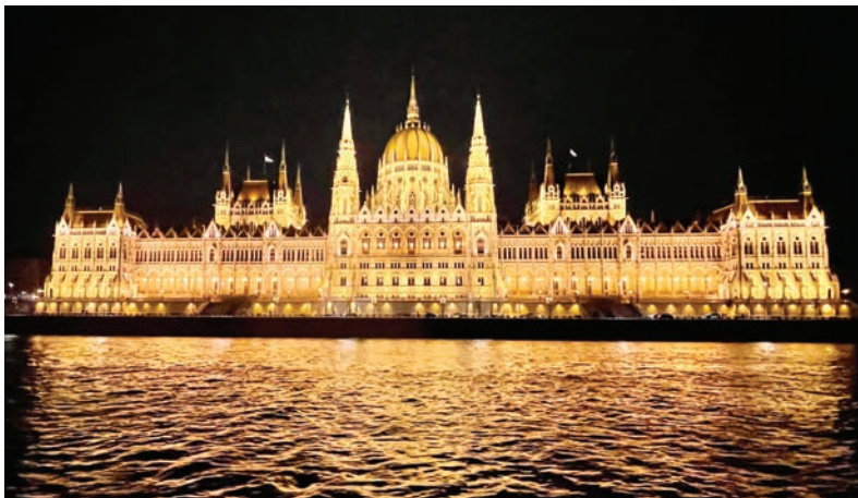
Hungarian Parliament Building

Dürnstein, at the entrance of Austria's Wachau Valley, is a charming, fairytale village of cobblestone lanes, apricot orchards, 16th century buildings, and the Dürnstein Castle where England's King Richard the Lionheart was imprisoned on his way back from the Crusades in 1192.