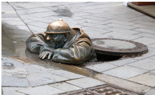
Cumil the Sewer Worker, in Bratislava, Slovakia