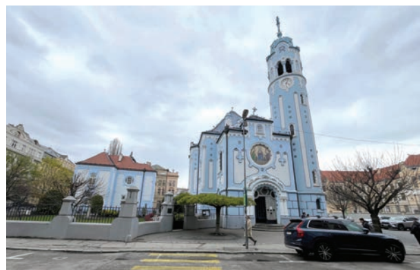
The Blue Church in Bratislava

From the ancient town of Melk, some travelers visited the Benedictine monastery or the Artstetten Castle and walked the halls of its most famed inhabitants, Archduke Franz Ferdinand and Duchess Sophie, while others did an immersion experience into the world of baking and bees with a demonstration by a master pastry chef and a local apiarist (honey producer).