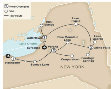
Adirondacks and Finger Lakes