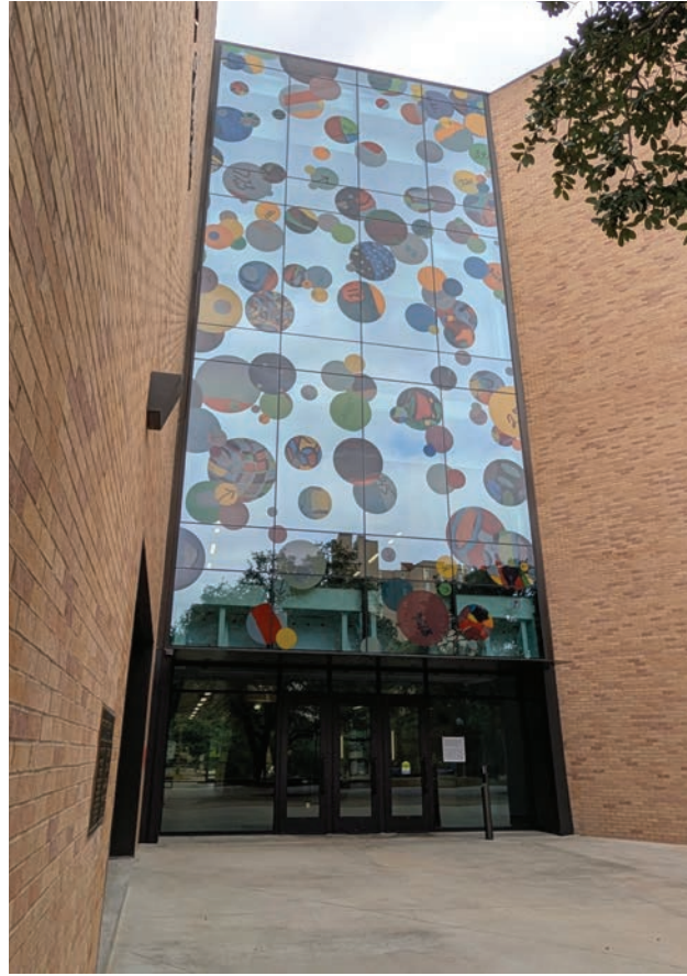
Autobiography: Circles by Howardina Pindell, installed on the George I. Sanchez Building plaza and part of the UT Austin “Landmarks” collection