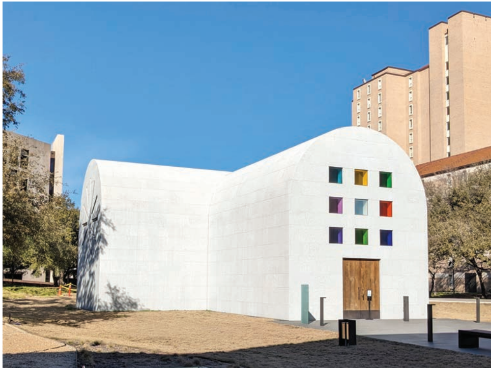
Austin, a free-standing building and chapel-like artwork by Ellsworth Kelly, near Blanton Museum of Art