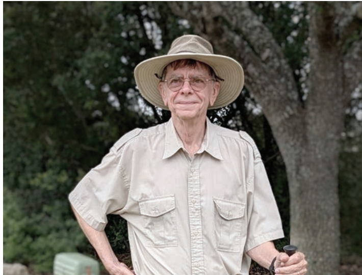
Ready for hiking