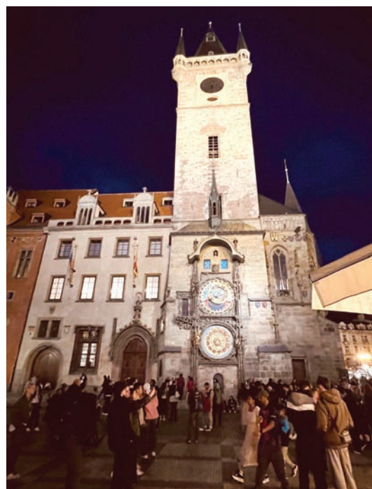
The Prague Astronomical Clock on the Old Town Hall, photo by Lori Threatt

And Facebook: https://www.facebook.com/groups/131246400563201