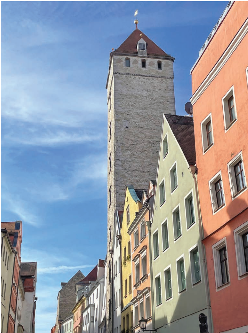
Patrician homes in Regensburg, Germany