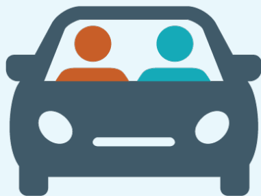
FIGURE 2: MANY TEXANS SEEKING ABORTION CARE RELY ON OTHERS FOR HELP

43% had someone drive them to get an abortion