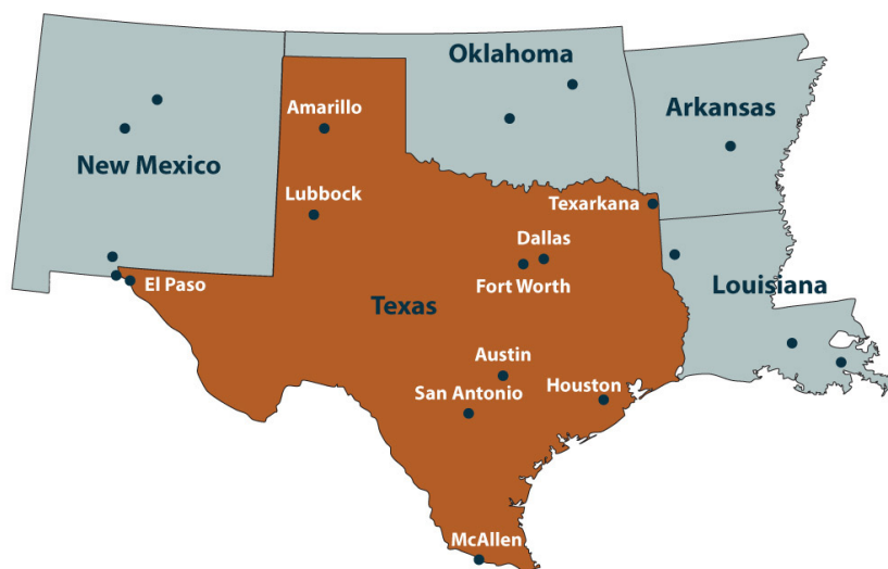
Table 2: One-way driving distances from select Texas cities to out-of-state facilities