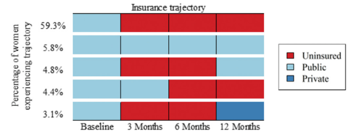
Figure 2. Most common insurance trajectories in the 12 months after childbirth (n = 1,489).

The most common trajectory of insurance coverage during study period, experienced by 59.3% of women, was to have a birth covered by public insurance, become uninsured by 3 months postpartum, and remain uninsured for the remainder of the year (Figure 2). The second-most common trajectory, experienced by 5.8% of women, was to remain on public insurance for the entire 12 months.