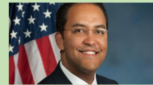
Congressman Will Hurd 23rd District of Texas