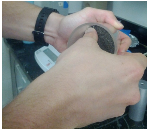
Figure 3: Densification of Soil Using Thumb