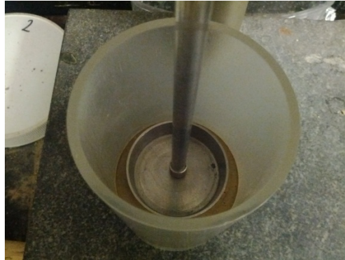
Figure 6: Measurement of Compacted Specimen Using Metal Plate and Mounted Caliper

bottom, and left sample heights, an acceptable range was +0.002” and -0.005” from the target height.