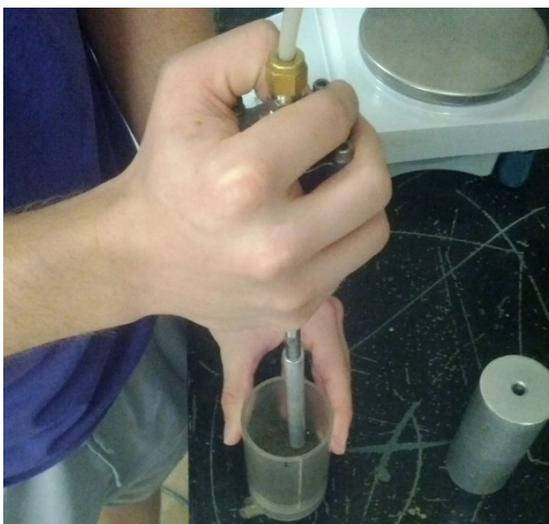
Figure 4: Compaction of Soil Specimen Using Small Diameter Kneading Compactor