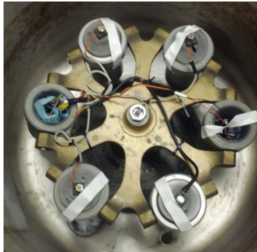
Figure 8: Assembled Testing Setup within the Centrifuge