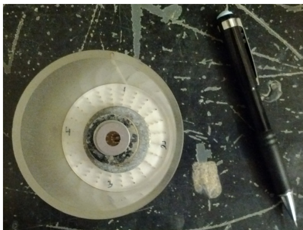
Figure 7: Assembled Permeameter Cup with Overburden Washers and Washers Simulating 51.3 Grams of Overburden from the Ponded Water