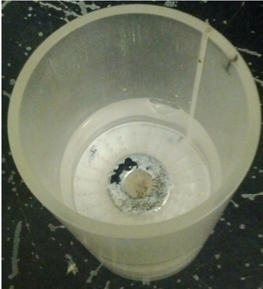
Figure 9: Final Permeameter Cup Assembly with 2 cm of Ponded Water Head and Overburden Washer