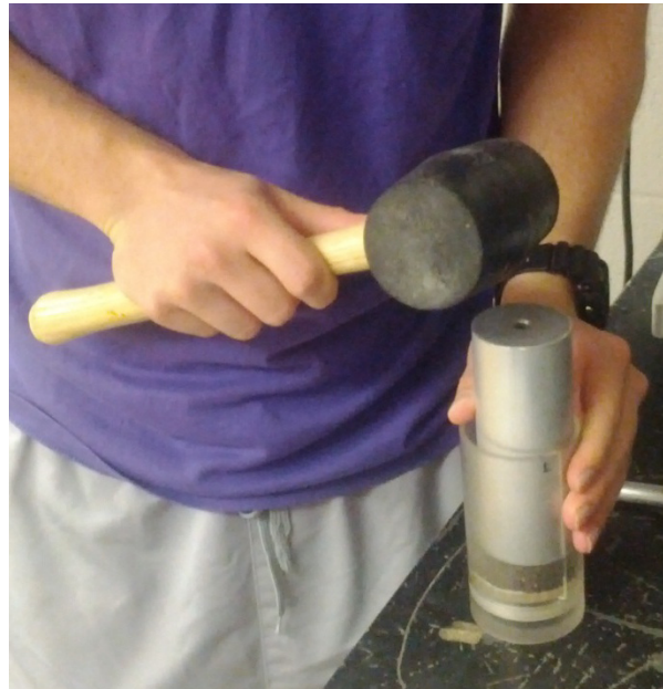
Figure 5: Compaction of Soil Specimen Using Rubber Mallet and Large Diameter Compaction Rod